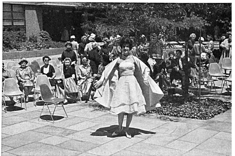
Embroidered organdie Organdi brodé Modèle Pauline Trigère, New York