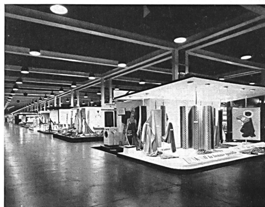
Some of the stands in the textile halls.

The success met with last year by the „Knitwear centre” encouraged its organisers to repeat the idea this