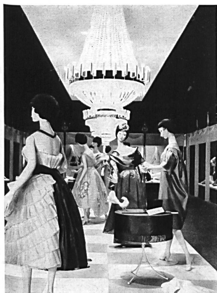
View of the „Madame- Monsieur” exhibition.

year, with a number of collective thematic displays alternating with individual stands forming part of a general scheme. From these the visitor will be able to gain a very good idea of what the knitwear industry has to offer.