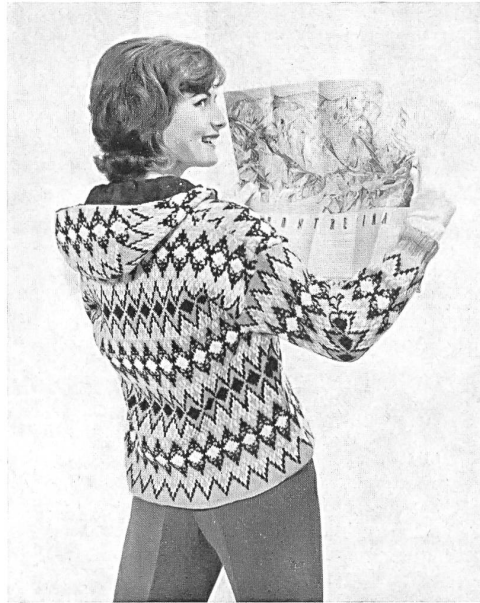
A price winning-model : reversible ski-jacket