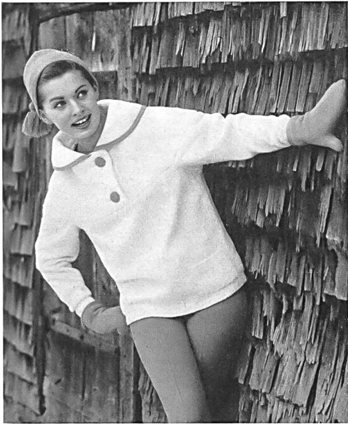
First price, white cossack blouse with orange trimmings, mittens and bonnet to match