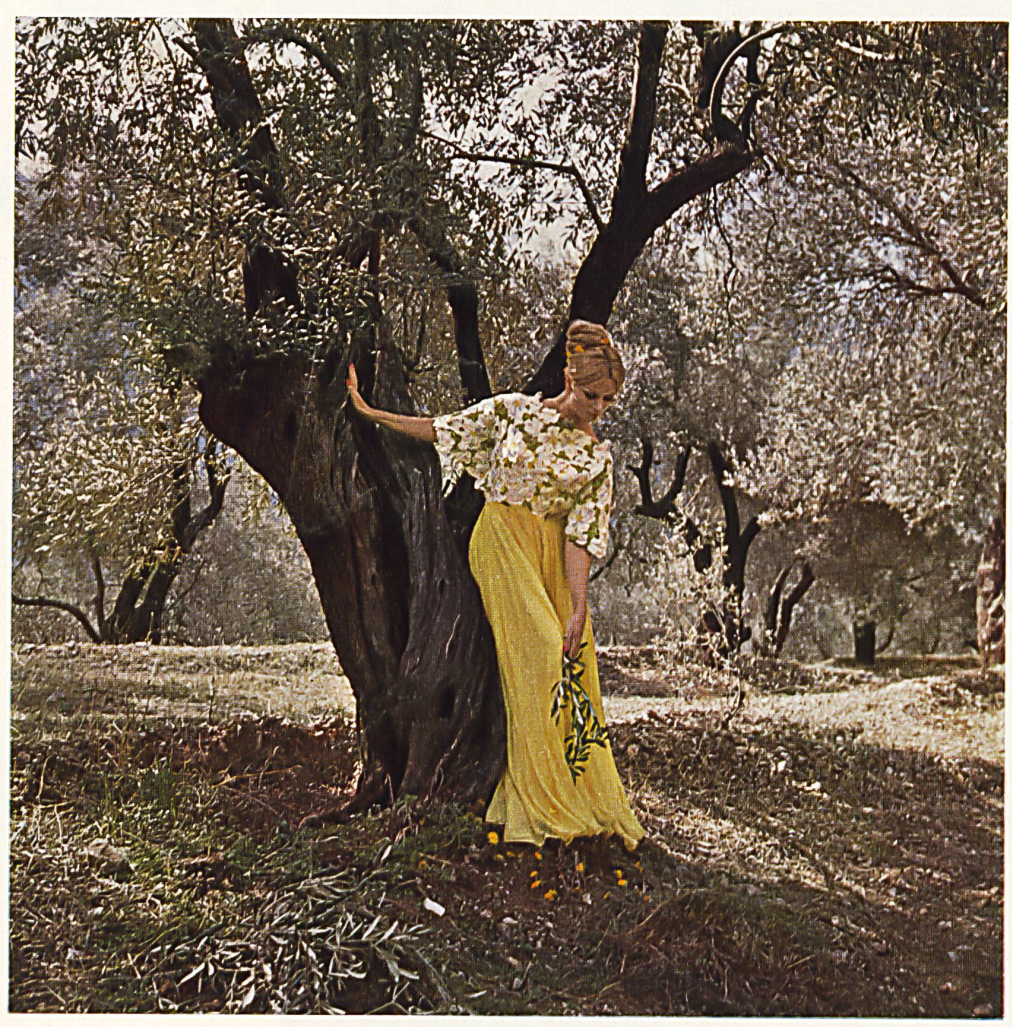
A. NAEF & CIE S. A., FLAWIL

Tissu brodé avec fleurs appliquées Embroidered fabric with appliquéd flowers Modèle Helen Rose, Los Angeles Reprinted from Harper's Bazaar