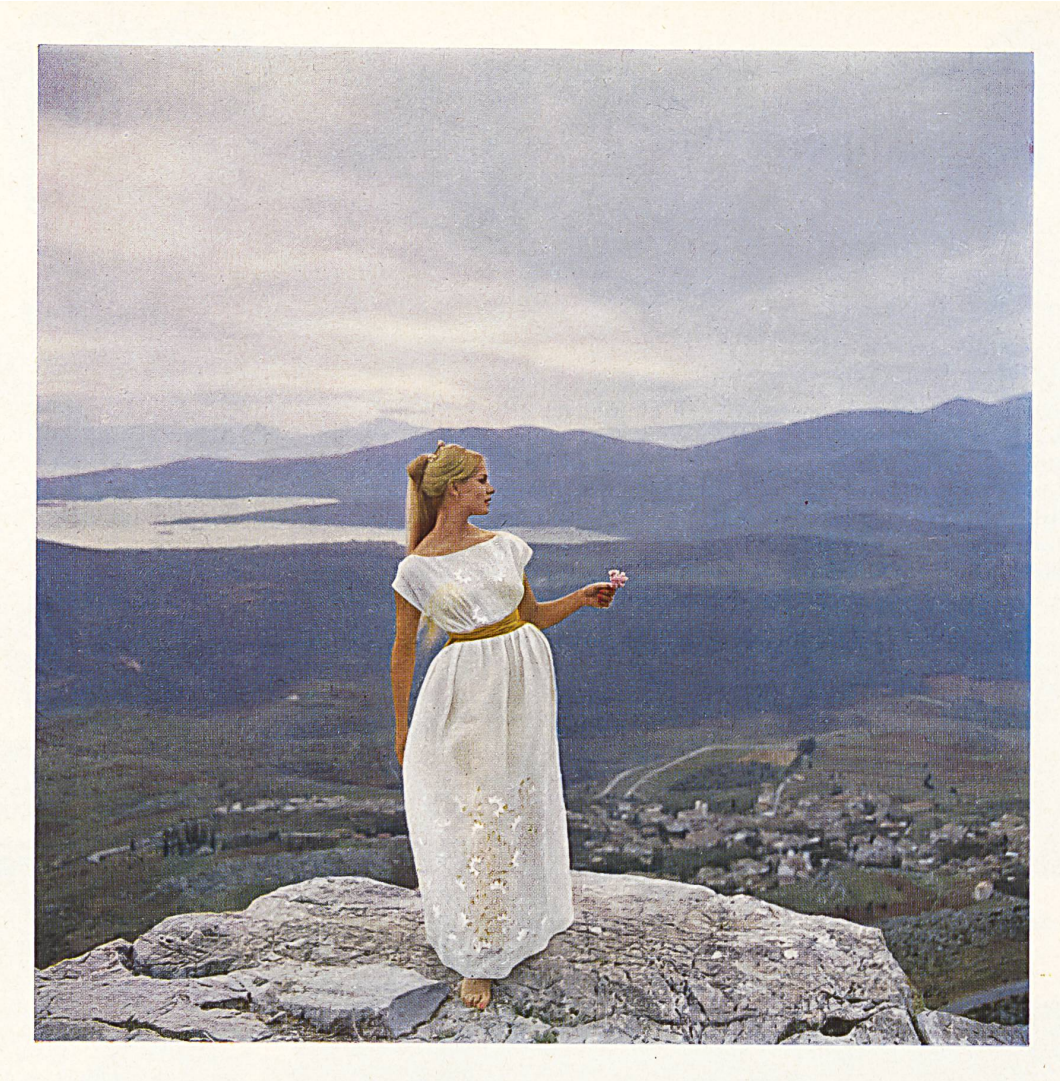
FORSTER WILLI & CO., SAINT-GALL