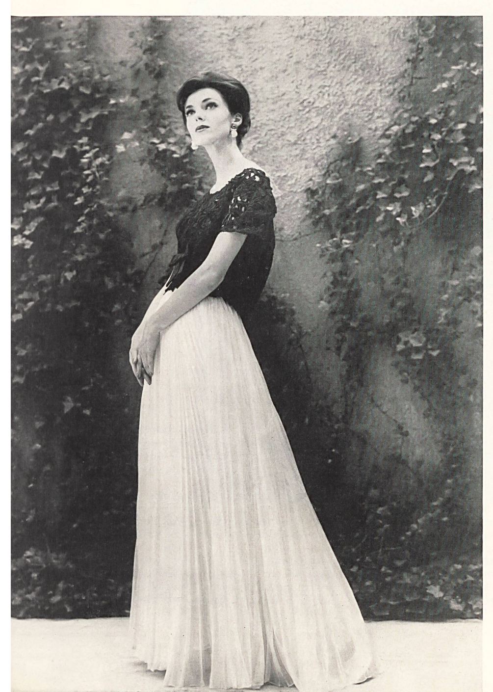
FORSTER WILLI & CO., SAINT-GALL

Swiss fabrics are also extremely popular for blouses. Sampson-Katzenberg Blouses for example uses embroidered Swiss panels and frills, H. Gross & Company presents two large groups of Swiss batiste blouses in classic style, while Gregory & Goldberg shows a group of cotton batiste blouses decorated with eyelet embroidery as well as a group of shirt-blouses in Swiss cottons with