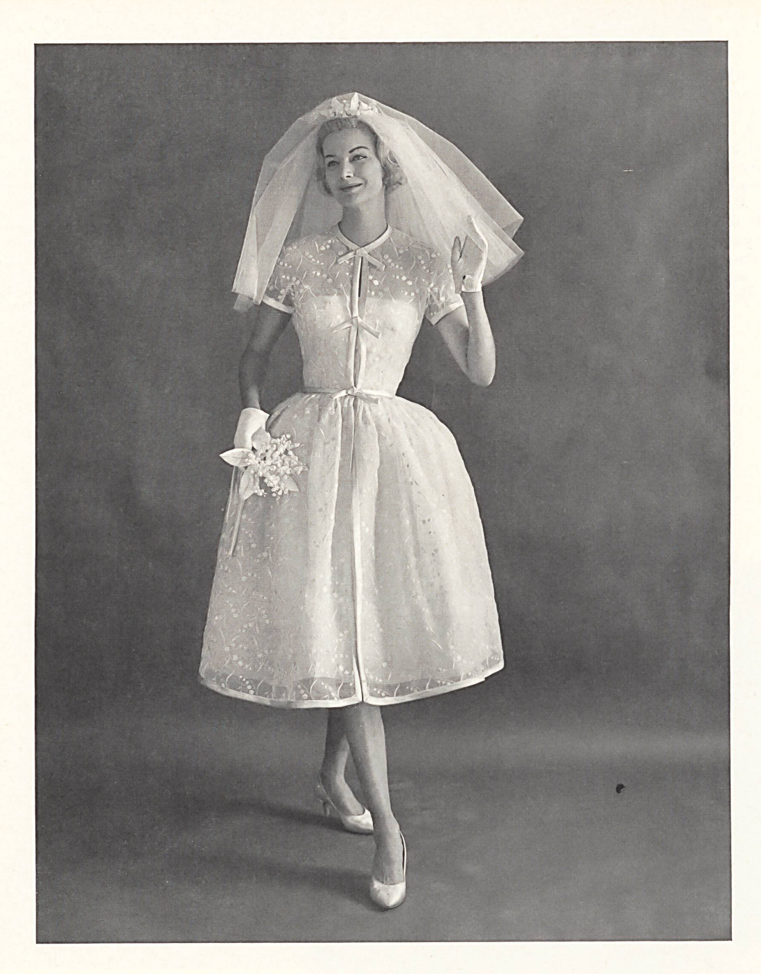
FORSTER WILLI & CO., SAINT-GALL

Tissu fin brodé — Embroidered sheer Modèle Hannah Troy, Inc.