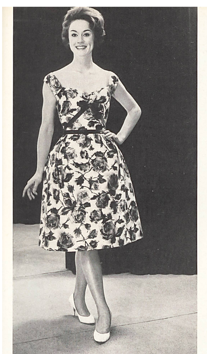
« RECO », REICHENBACH & CO., SAINT-GALL