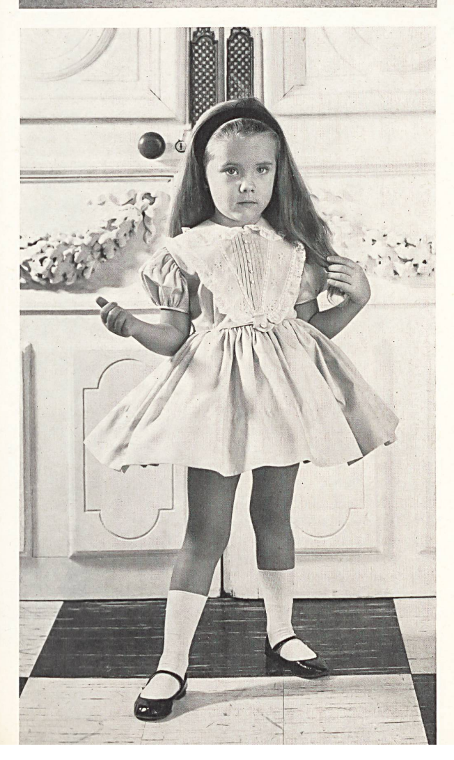
A. NAEF & CIE. S. A., FLAWIL Garnitures brodées — Embroidered trims Modèle Celeste Frocks, Inc.