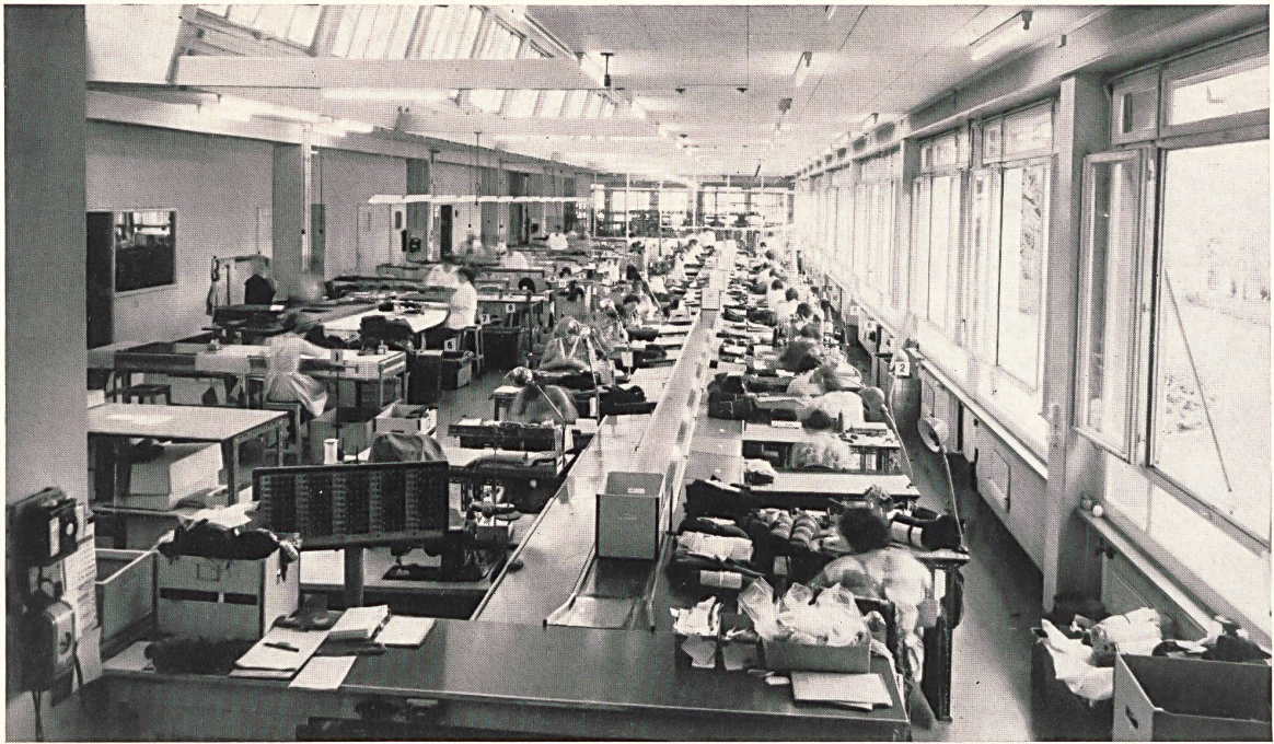
Sewing room with a modern device for the rational division of labour (no chain production)

enlightened and understanding machinery manufacturer to make an important knitting machine accessory, on which is based the successful application of the Jacquard technique to knitting.