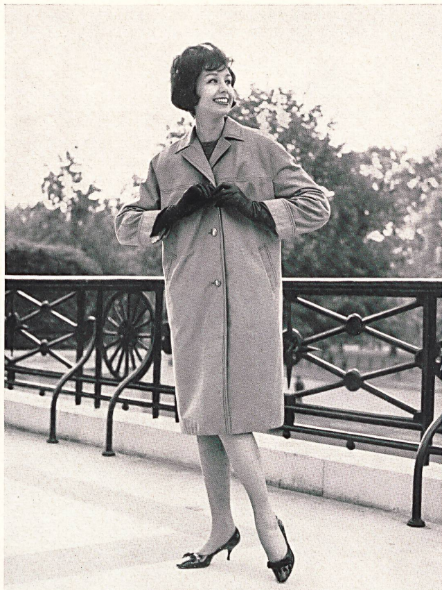
Manteau de pluie en tissu de coton suisse hydrofugé Raincoat made of Swiss water repellent cotton fabric Abrigo de lluvia en tejido algodón hidrofugado suizo Regenmantel aus schweizerischem impräniertem Baumwollgewebe