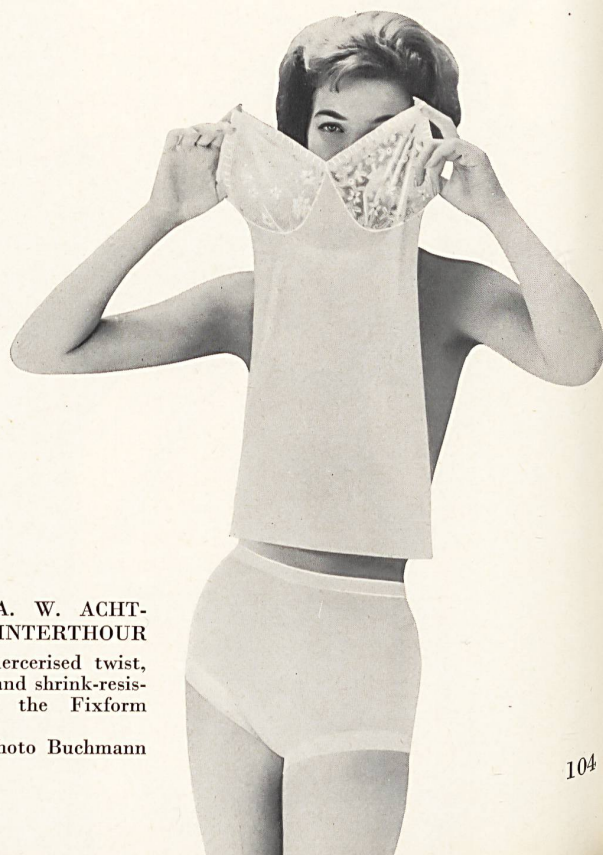
« SAWACO », S.A. W. ACHTNICH & CO., WINTERTHOUR

Lingerie set in mercerised twist, soft to the touch and shrink-resistant, thanks to the Fixform finish.