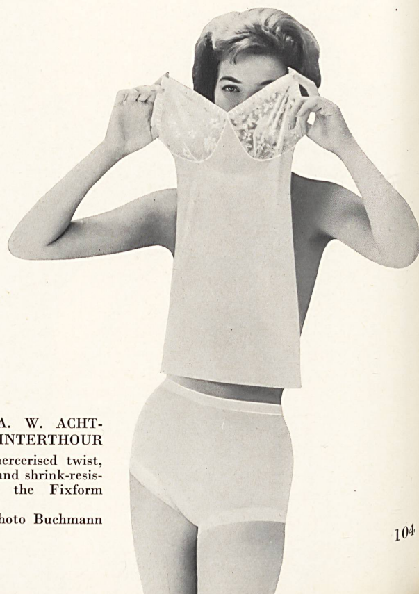
« SAWACO », S.A. W. ACHTNICH & CO., WINTERTHOUR Lingerie set in mercerised twist, soft to the touch and shrink-resistant, thanks to the Fixform finish.