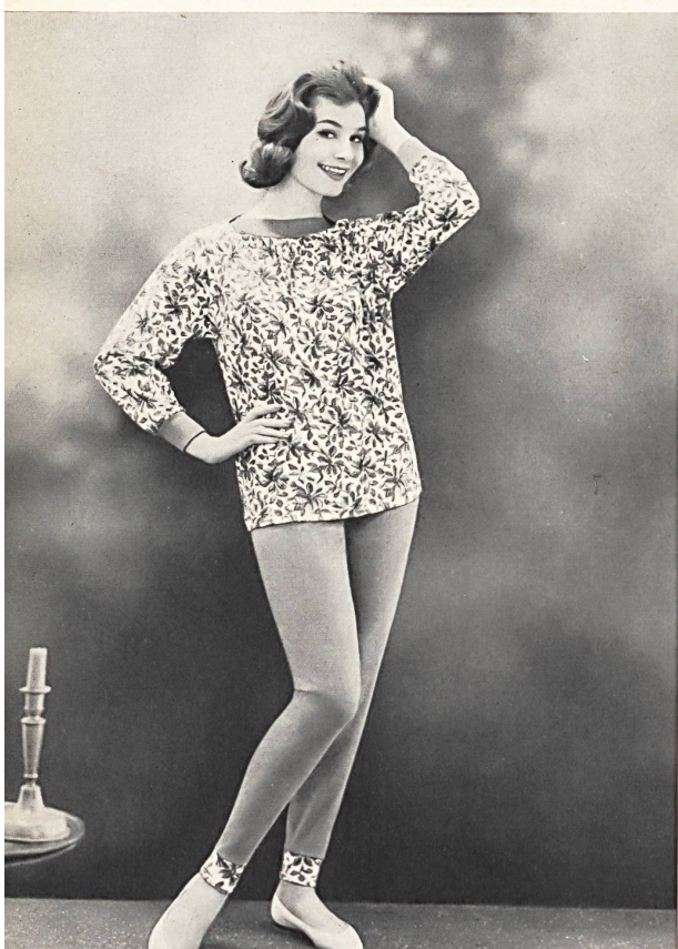
« SAWACO », S.A. W. ACHTNICH & CO., WINTERTHOUR

Buying interest focused mainly on the fashionable and high quality products of the lingerie and corsetry industries. There was a heavy demand for fashionable underwear, cami-knickers, night wear, lingerie in new materials and original colours. In corsets, business was most brisk among the articles that offered new features and were the most fashionable from the points of view of colour, cut and style. Apart from white, the prevailing colour, black as well as unobtrusive checks proved extremely popular. Some eighty models of lingerie and corsets were presented at each of the ten parades that were put on during the three days the fair lasted.