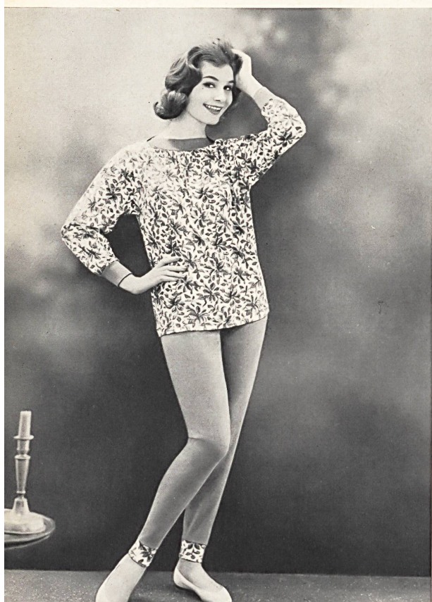
« SAWACO », S.A. W. ACHTNICH & CO., WINTERTHOUR

Buying interest focused mainly on the fashionable and high quality products of the lingerie and corsetry industries. There was a heavy demand for fashionable underwear, cami-knickers, night wear, lingerie in new materials and original colours. In corsets, business was most brisk among the articles that offered new features and were the most fashionable from the points of view of colour, cut and style. Apart from white, the prevailing colour, black as well as unobtrusive checks proved extremely popular. Some eighty models of lingerie and corsets were presented at each of the ten parades that were put on during the three days the fair lasted.