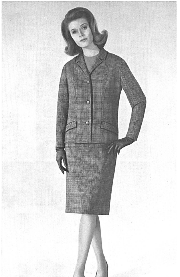
Modèle « YALA », JAKOB LAIB & CO., AMRISWIL Classical style jersey suit