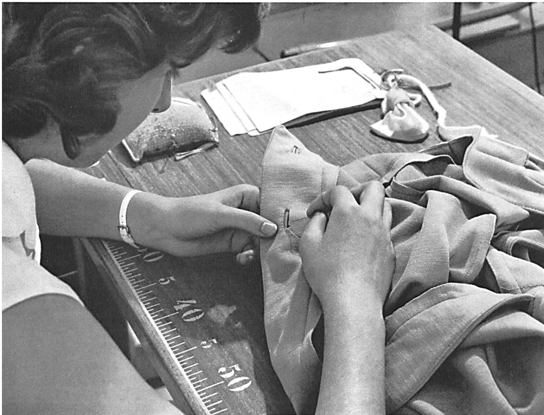
The Swiss knitwear industry lays great importance on the vocational training of future generations