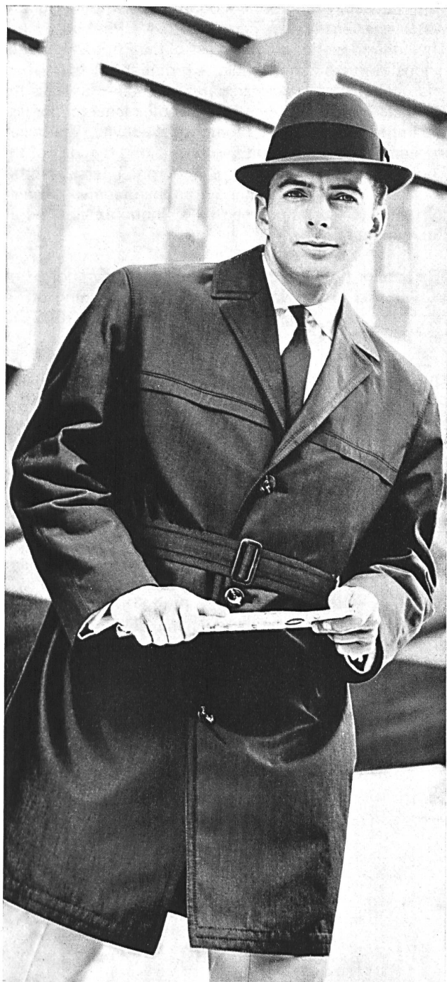
Man's raincoat made from 100% cotton with a Phobotex finish.