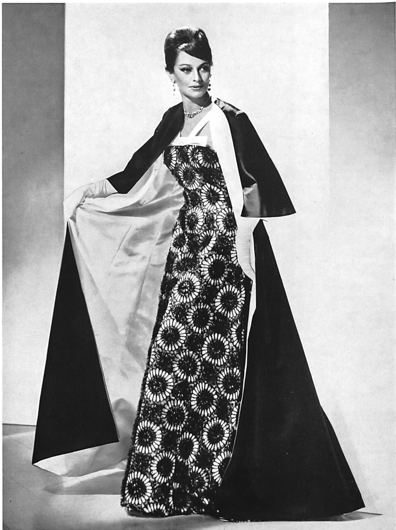
FORSTER WILLI & CO., SAINT-GALL Guipure noire rebrodée Black re-embroidered etched lace