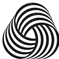
PURE LAINE VIERGE

IWS, the International Wool Secretariat, is a publicity organization supported by 200 000 wool producers in Australia, New Zealand and South Africa. Its aim is not so much to step up the use of wool, since the production of this fibre cannot be increased indefinitely, but to improve its wearing qualities and to make them known. At the same time, it tries to protect the reputation of high quality virgin wool against the harm that can be done to it by the use of low quality wool (more especially shoddy) whose properties no longer satisfy present-day requirements. This aspect of the work of IWS was dealt with at a recent press conference during which the main members of IWS's Zurich office presented to representatives of the Swiss press the new international label (see above) protecting products made of pure virgin wool. This label has already been registered in over 90 countries and is used for the moment as an indication of quality mainly for knitting wool, fabrics, blankets and carpets. Its use implies compliance with certain