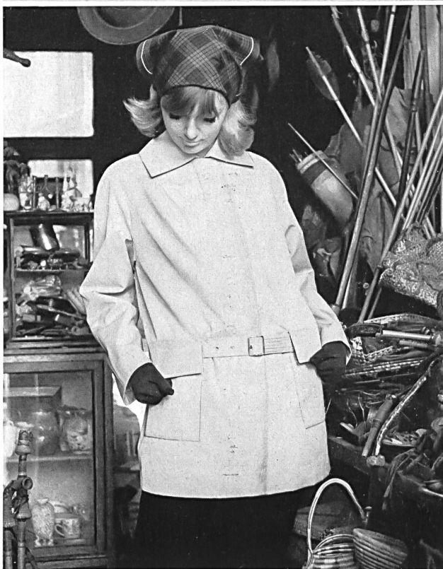
3 STOFFEL LTD., SAINT-GALL Tissu Aquaperl à finissage hydrofuge et antitaches Scotchgard Aquaperl fabric with Scotchgard rain and stain repeller finish Modèles: (à gauche / left) Heptex Ltd., Leeds (à droite / right) Cotsmoor Ltd., London