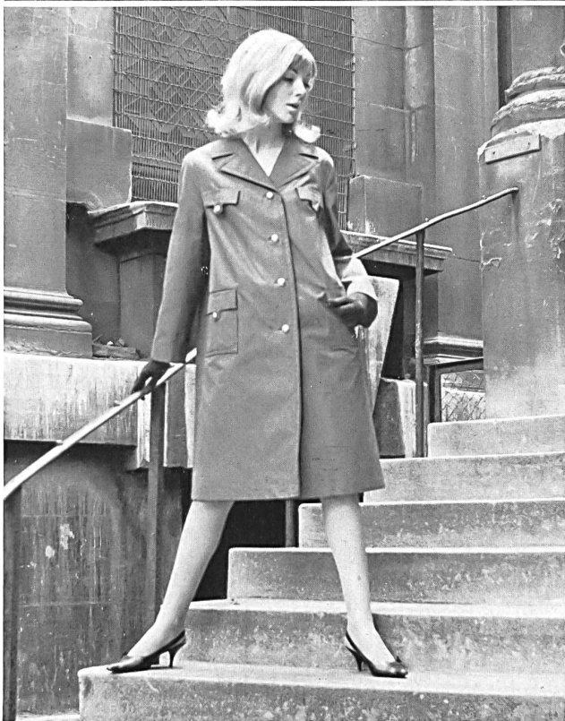
1 STOFFEL LTD., SAINT-GALL Tissu Aquaperl à finissage hydrofuge et antitaches Scotchgard Aquaperl fabric with Scotchgard rain and stain repeller finish Modèle: Morcosia