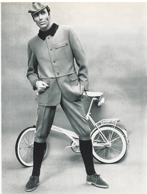
Ritex cycling outfit, in water-repellent pure wool; jacket with zip-on basques.