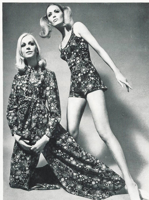
Lahco beach outfit: printed swimsuit in Helanca ® and Antron ® bouclé with cotton voile pyjamas to match printed with the same design.