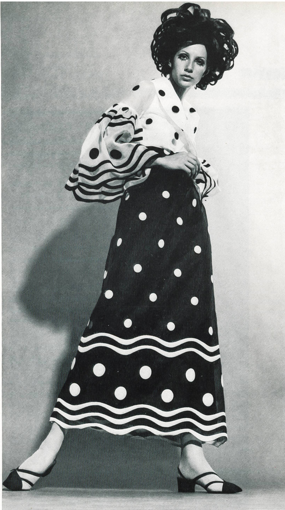
Model: Barocco, Rome Embroidered organza by FISBA DE SAINT-GALL