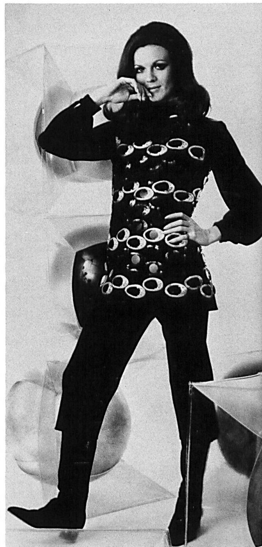
MILA SCHOEN, MILAN Cut out spangled embroidery with jewels, on organza, by JAKOB SCHLAEPFER & CO. LTD., ST-GALL