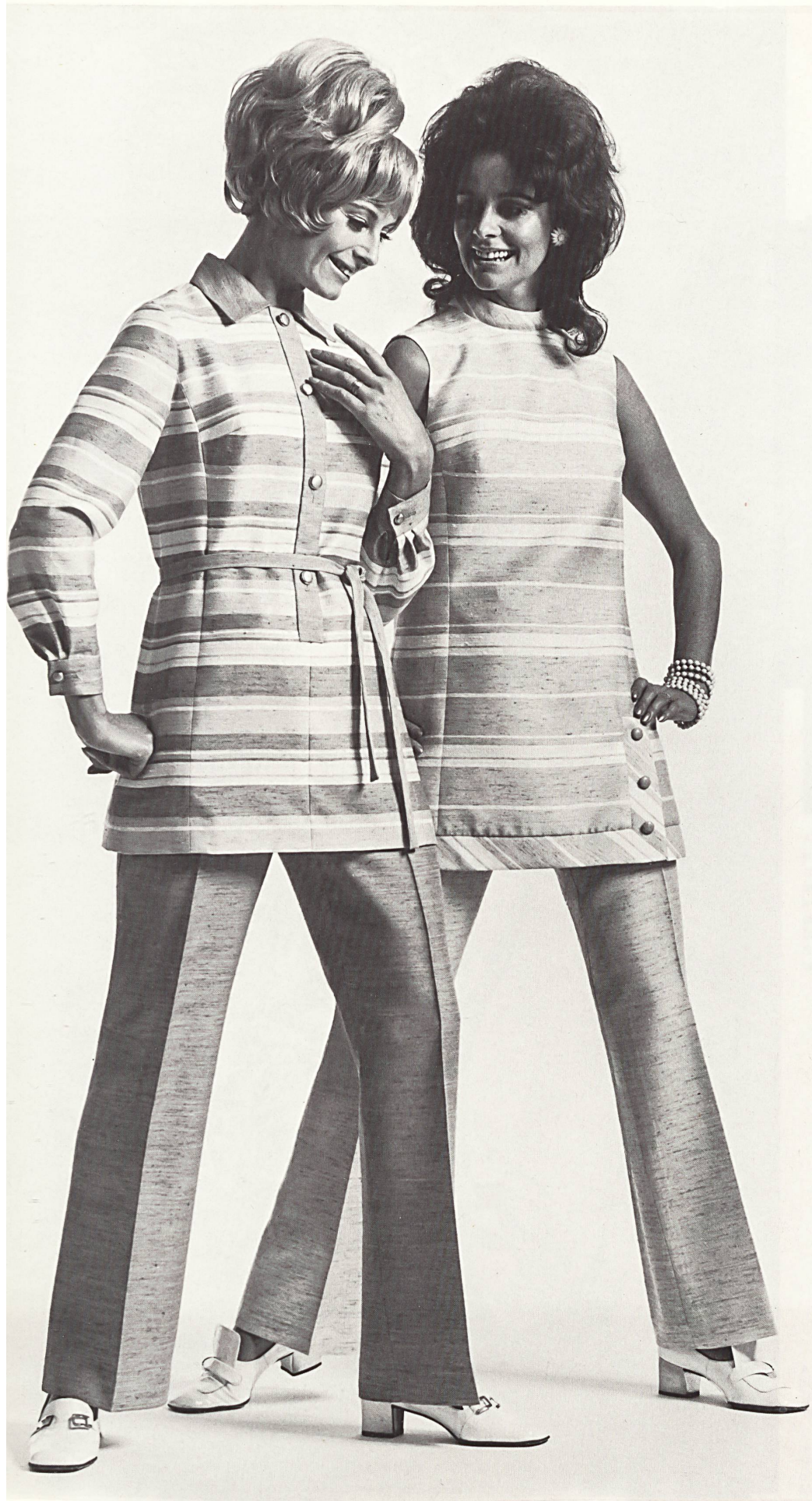
◀ STEHLI SILKS LTD., OBFELDEN Elegant pant suits in plain and striped Carmela shantung Models: Elida of London