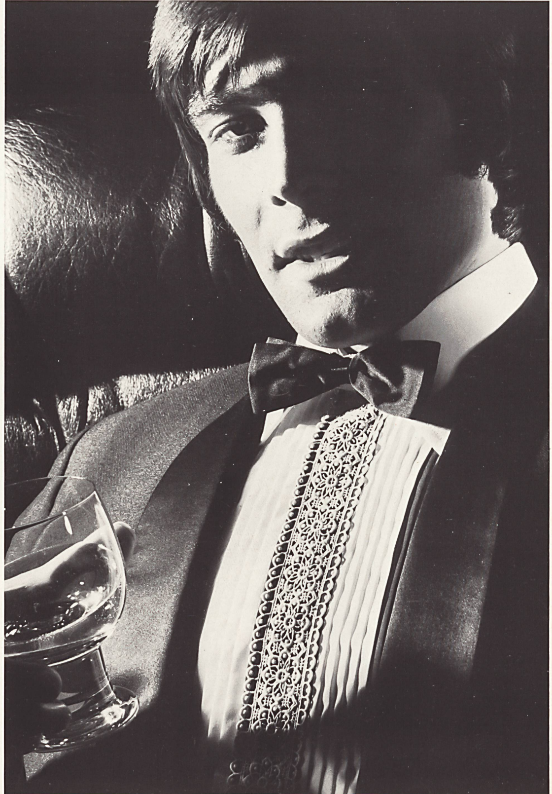
UNION LTD., ST-GALL Elegant dress shirt features galloon embroidery on the fly front, framed by discreet pin-tucks, and a band of contrast colour for emphasis. Design by Le Roi Menswear Ltd., London