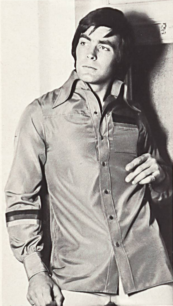
STÜNZI SONS LTD., HORGEN Original shirt in a soft, washable crêpe de Chine in 100% Tersuisse®, with a stitched yoke, puritan collar and contrast bands on the pocket and sleeve. Design by Nicholas Stoodley in London Ltd., London

reflected in all styles of shirts, from casual to semi-formal and formal models. Among the best-represented Swiss fabrics in current British shirt collections are plain and printed cotton voiles, tone-on-tone or contrasting cotton clipcords, cotton and polyester jacquards, striped seersuckers including overprinted Tutorette and Ondorette varieties. A new printed version of crepon is back; polyester and cotton mixture fabrics are in wide demand. The