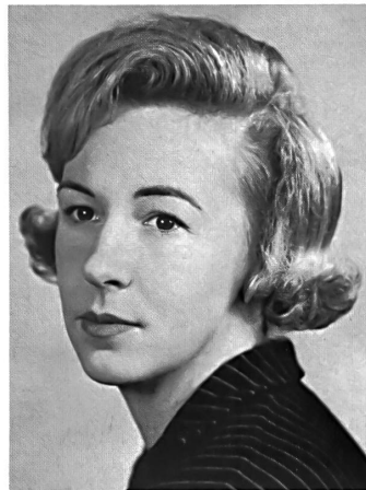
WEISBROD-ZÜRCHER AG HAUSEN a.A.

Full length evening gown in white "Lascara" pure spun viscose, with navy blue shawl and white flowers.