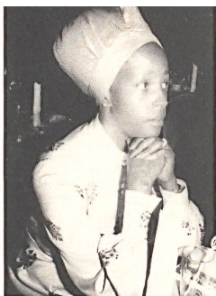
Blouse and skirt in cotton voile and piqué print by Christian Fischbacher Co. Ltd., St. Gall