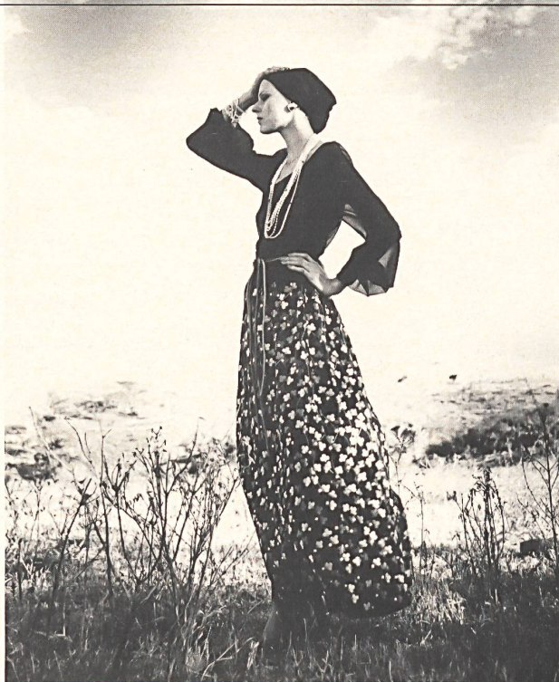
Long skirt in multi-coloured embroidery on black ground by Union Co. Ltd., St. Gall