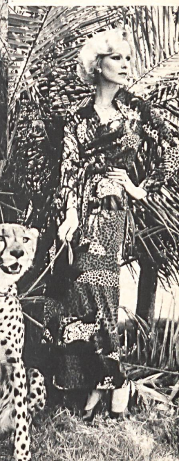
Exclusive model in soft cotton reps with the typical JOCELYN® printed design by Abraham Co. Ltd., Zurich

Elegant sporty fashions, created with exclusive Swiss materials, are the answer to the desire of every modern woman for something out of the ordinary. Walter Bollag of Switzerland recently launched just such a fashion under the name of JOCELYN®, with a leopard for its trademark, symbol of class and distinction. JOCELYN® models are already well-known abroad, so the manufacturer felt the time had come to make his