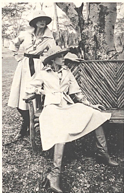
Modern safari-look dress and two-piece outfit in cotton/Dacron® poplin by Stoffel Co. Ltd., St. Gall