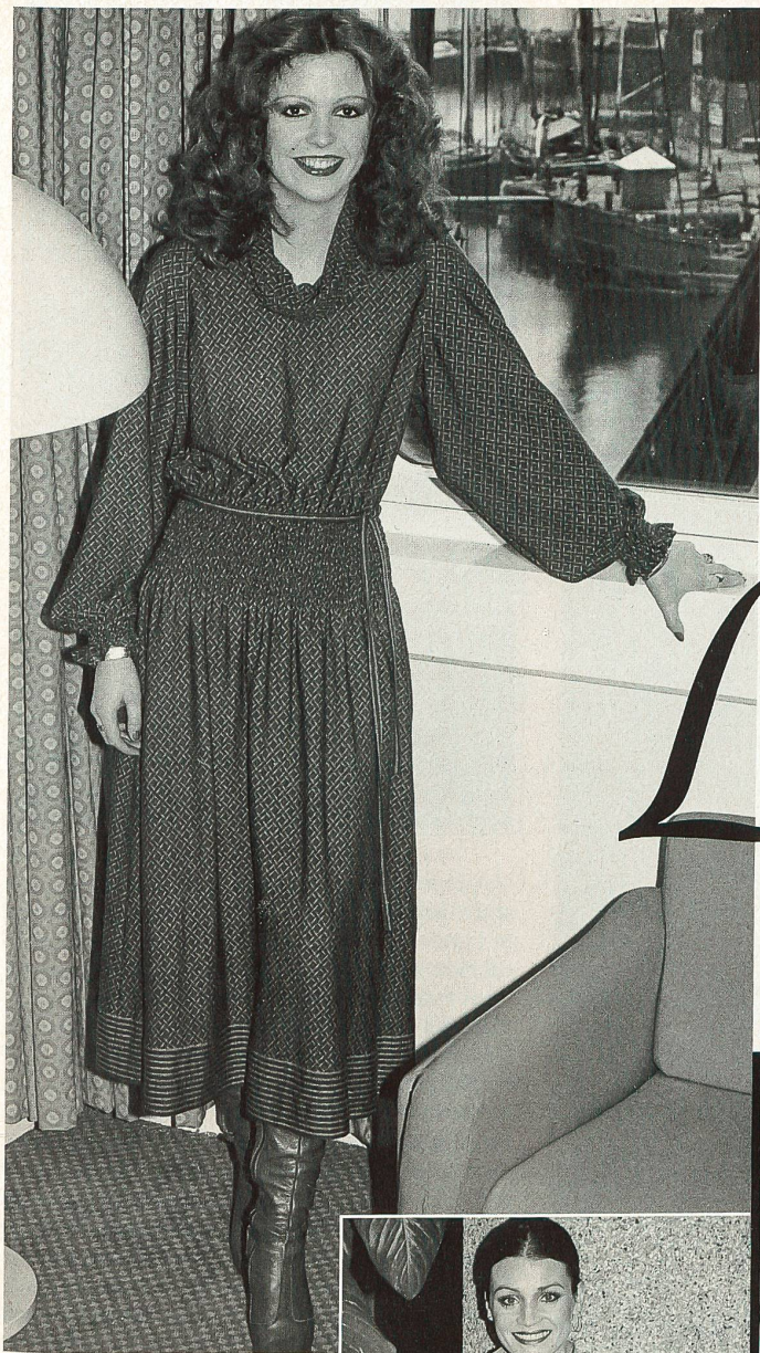
CHRISTIAN FISCHBACHER CO. AG ST. GALL

Fine printed wool jersey "Milena" in wine and grey was chosen by Jaeger, London autumn/winter collection 1978 for this elegant day dress with shirred waist, cuffs and large roll collar. Matching striped fabric was used for border around the hem and for narrow belt.