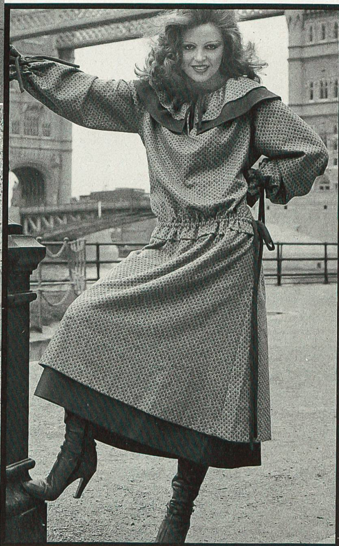
HAUSAMMANN + MOOS AG WEISSLINGEN