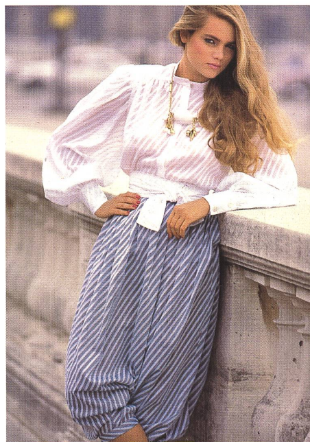
Pure cotton voile with jacquard clipcords from Wetter + Co. Ltd., Herisau

of the brothers Offergelt is undoubtedly their expansion into fashion publishing. Back in the early Sixties they launched a fashion magazine using the already existing photographic material from the fabric catalogue. Profit centers had not yet been invented, yet this is exactly what the far-sighted brothers established. In practically one single effort Offergelt obtained a costsharing instrument, an advertising media for their fabrics and an imageforming tool for their brand name. Today, Elégance Paris has a circulation of 200 000 copies and is sold worldwide to consumers through newspaper vendors. Upon its release, the magazine almost immediately started to create demand for Elégance fabrics in countries which hitherto