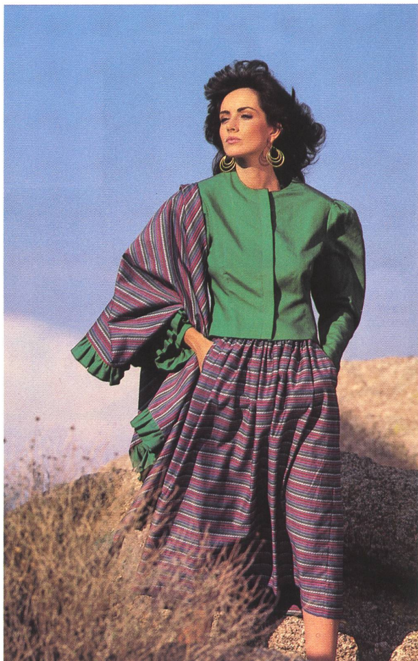
Colour woven pure cotton from Wetter + Co. Ltd., Herisau