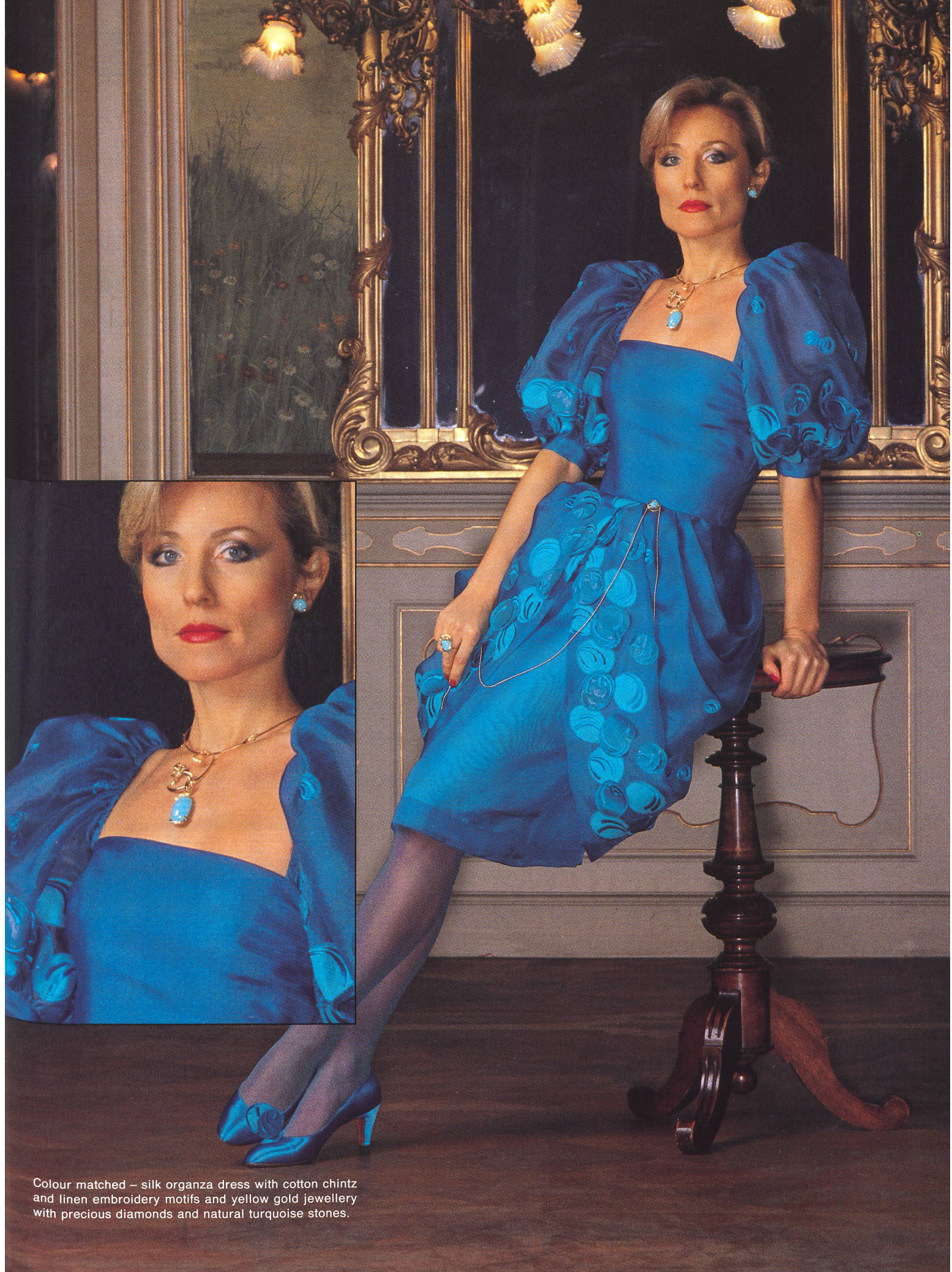
Colour matched – silk organza dress with cotton chintz and linen embroidery motifs and yellow gold jewellery with precious diamonds and natural turquoise stones.