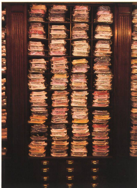
Most of the renowned shirtmakers in Jermyn Street also carry ready-to-wear shirts, from classic one-colour models to conventional or fashionable stripes and checks. Hilditch & Key.

pyjamas, robes, nightshirts, dressing gowns and ladies' shirts and blouses, and there is also a bespoke tailoring branch just off Jermyn Street.