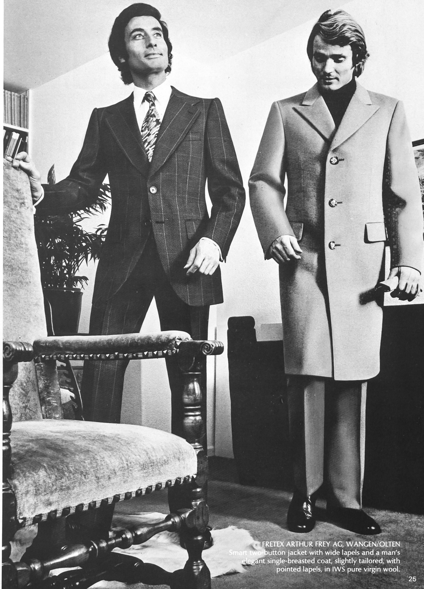
FRETEX ARTHUR FREY AG, WANGEN/OLTEN Smart two-button jacket with wide lapels and a man's elegant single-breasted coat, slightly tailored, with pointed lapels, in IWS pure virgin wool.