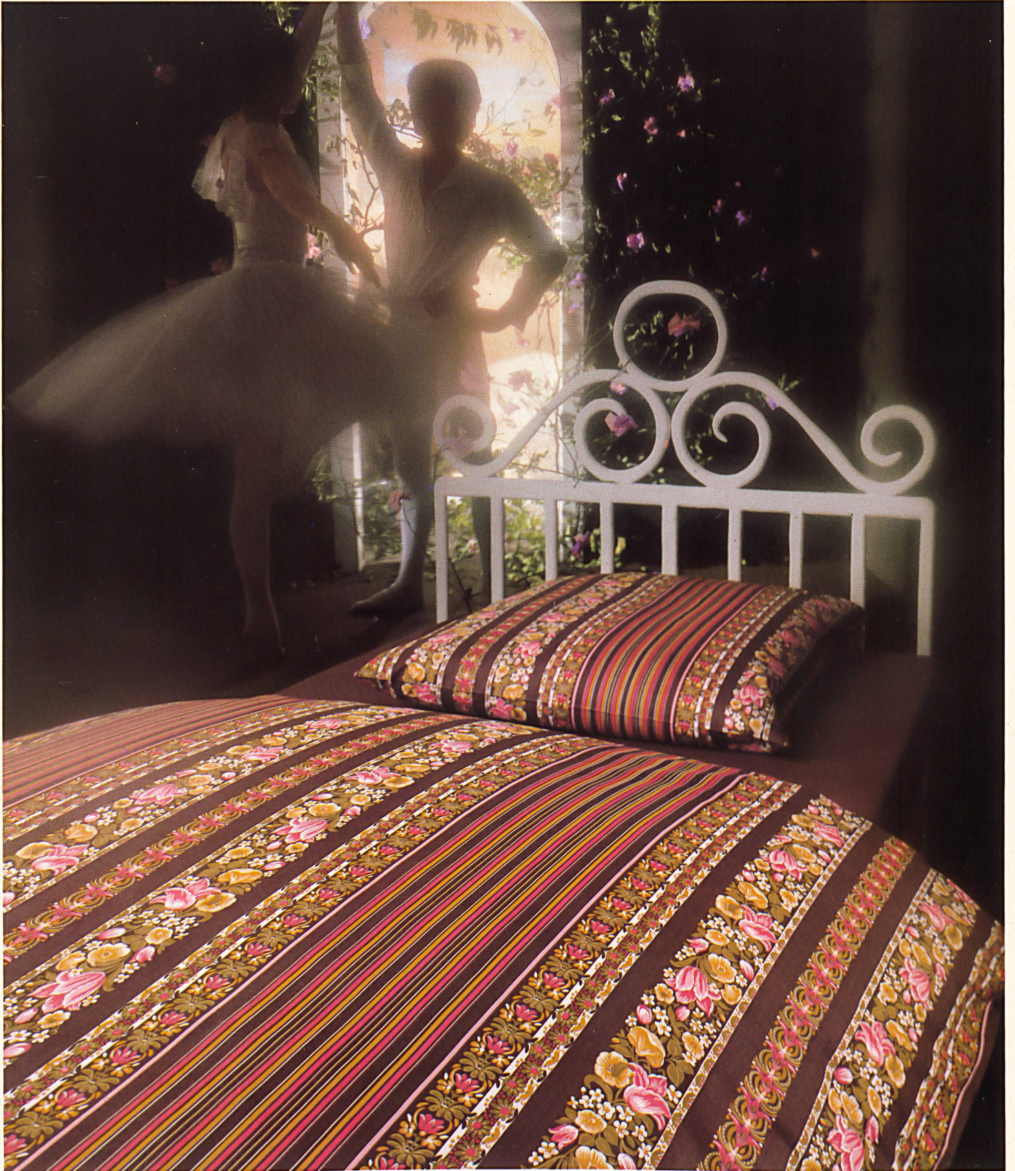
“Allegría”, a design from the “Farm-House” group. Attractive combination of strict geometric stripes with folk-art floral stripes, in luminous pastel shades on a dark ground. Matching the “Muralto” and “Mayfair” colour ranges, combined here with a “Jersey/Stretch” fitted sheet in “Muralto” café.