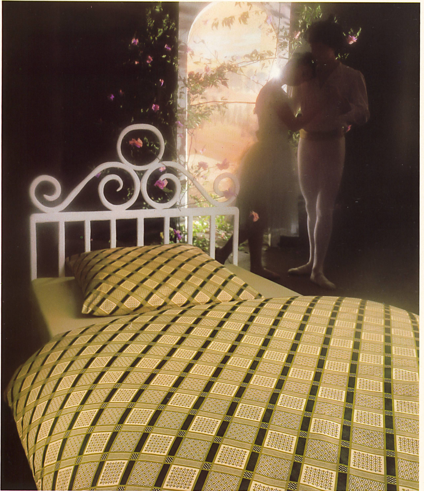
“Quadro”, a geometric design in harmonious colours on beige ground from the Studio collection. The severity of the diagonal squares is softened by tiny dots. Colour-matched to the “Muralto” range, combined here with a “Jersey/Stretch” fitted sheet in “Muralto” olive.