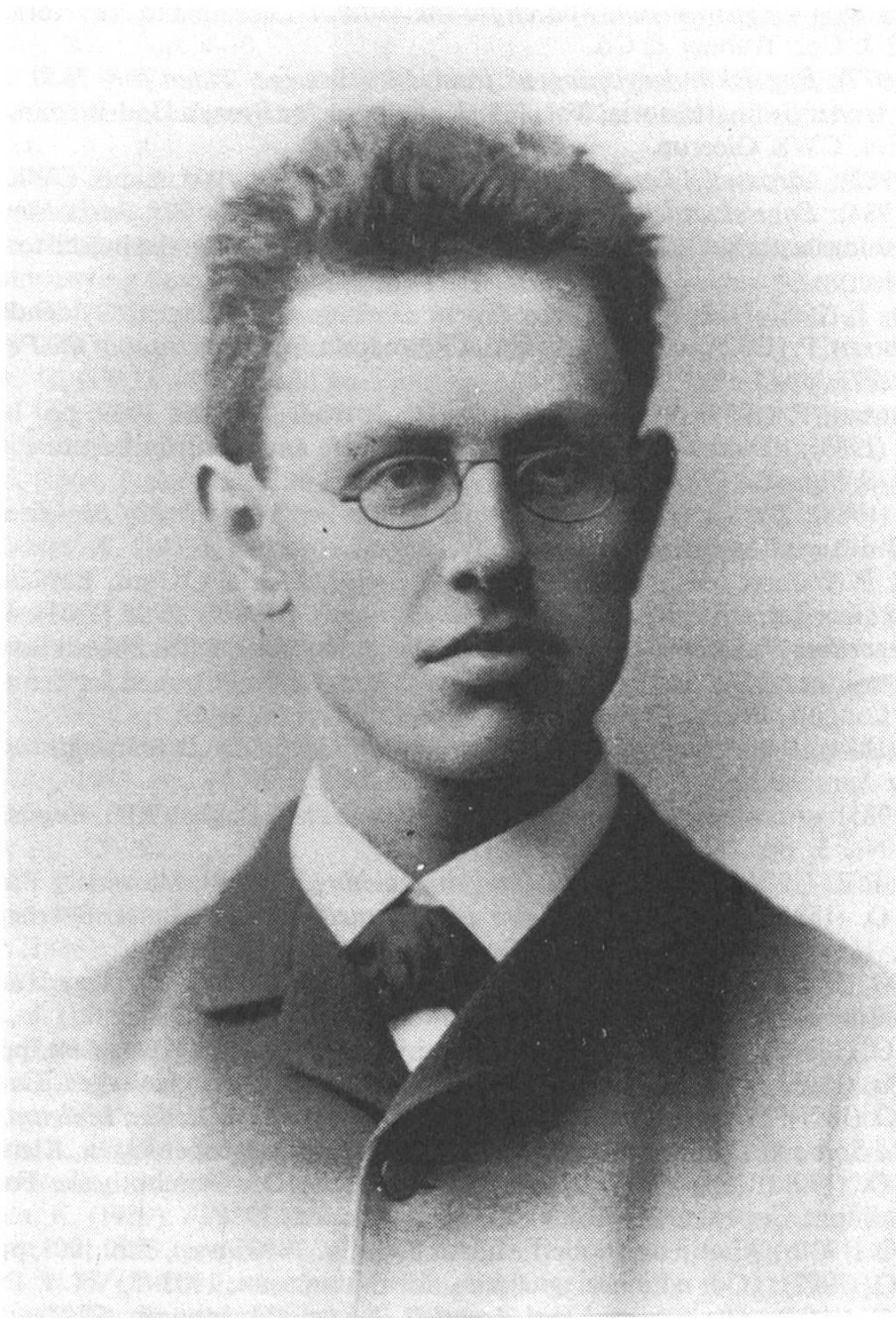
Otto JESPERSEN (1887)