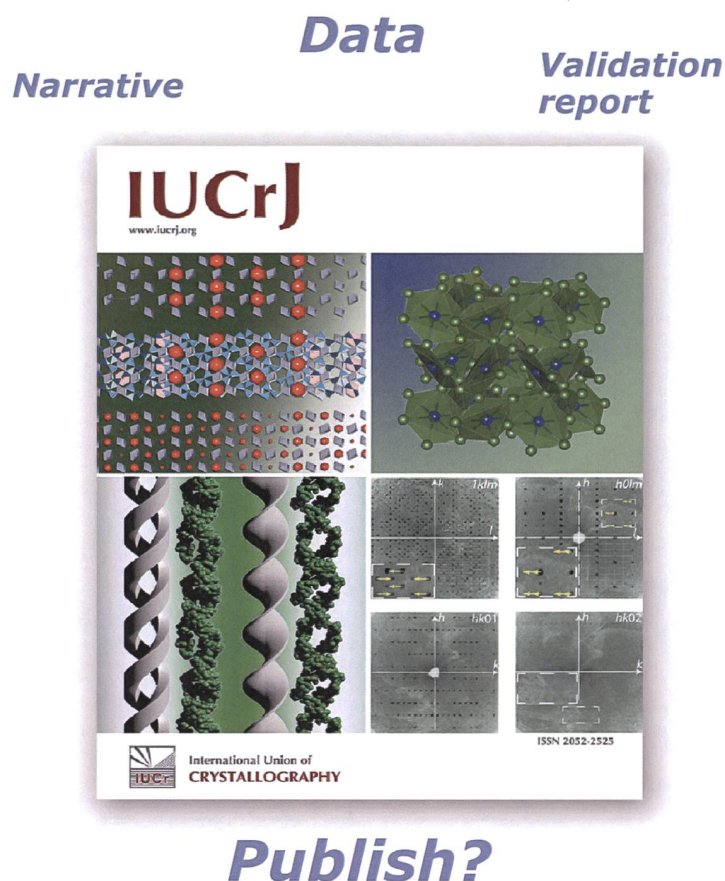
Figure 1. The Editor as the gatekeeper of reproducible science knowledge and on which basis replicability by others, and ultimately wisdom, can rely.

improve them and reduce variations in analysis. An early example of software improvement for processing of raw data (oscillation camera diffraction images recorded on film) was the comparative “round robin” project of Helliwell et al. (1981).