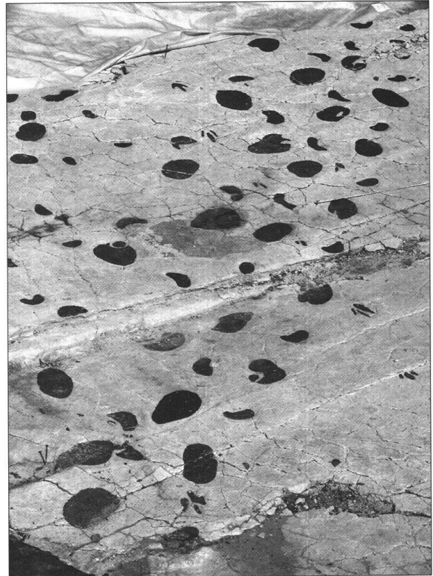
Fig. 3: Chevenaz-Combe Ronde: Numerous (stained) tracks of sauropods and theropods – dinosaur families.

After lunch the party is split into two groups: