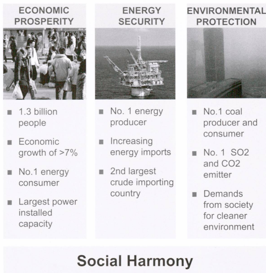
Fig. 1: The strategic drivers for China policy makers.

2012, Shell published its Onshore Oil and Gas Operating Principles. The company is making all of Shell's operated onshore projects where hydraulic fracturing is used to produce gas and oil from tight sandstone or shale, consistent with these principles and with local rules and regulations. The reason for making these public was in response to concern around the development of unconventional resources, especially with regard to the practice of hydraulic fracturing. It creates transparency as the public today demands and allows Shell to share «how we do our business». It also demonstrates confidence, which is based on 60 years of onshore operational experience, including the use of hydraulic fracturing, and underpins how the company works today and how it aspires to improve. The operating princi-