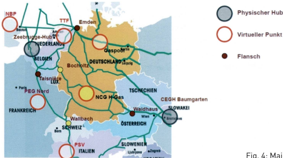
Fig. 4: Major European gas hubs.

GW of turbine power, which could end up in blackout.