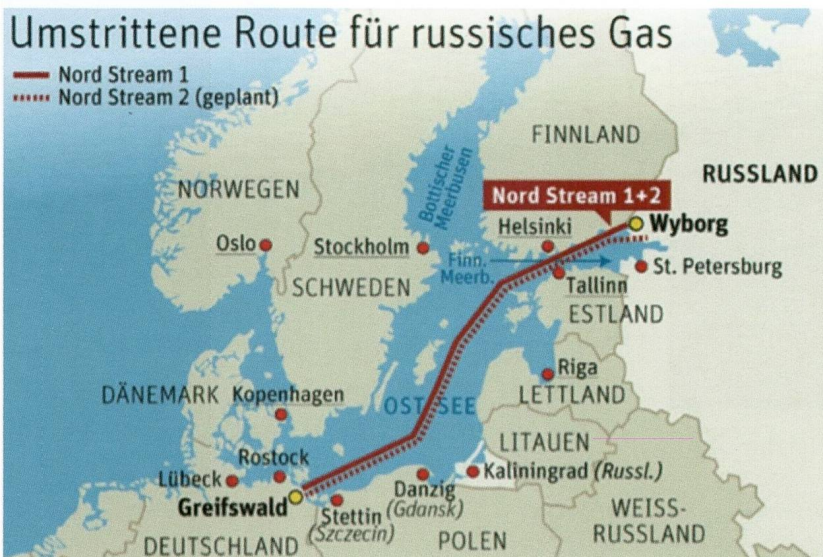
Fig. 3: