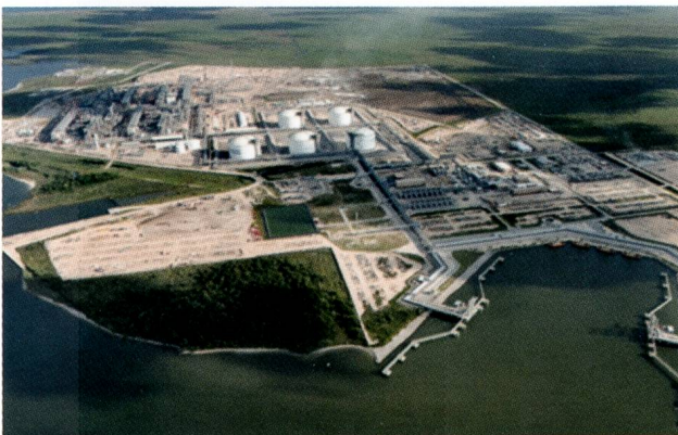
Fig. 1: Sabine Pass LNG-Terminal (Louisiana USA).

Today the main market drives of global gas market is Henry Hub, representing the US gas market, Net Connect Germany (NCG) representing the European gas market and Japan LNG Hub representing the Asian market.