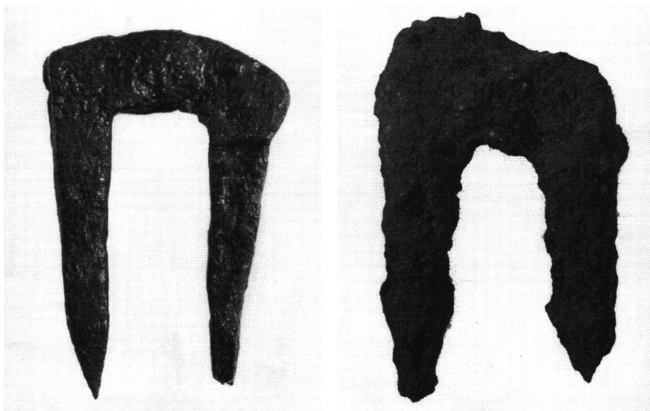
Fig. 2 Hinge after plasma treatment (left) and a similar artifact covered by its conglomerate layer (right).