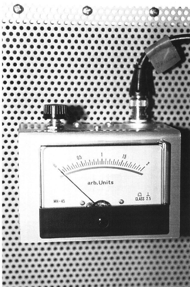
Fig. 2 Plasma current instrument.

From the vacuum pump, after compressed air is added, the gas-mixture enters the combustion chamber where all dangerous components will be burnt. Since this equipment was first delivered to us we have gained a lot of experience in its use and in improvements for conservation treatments.