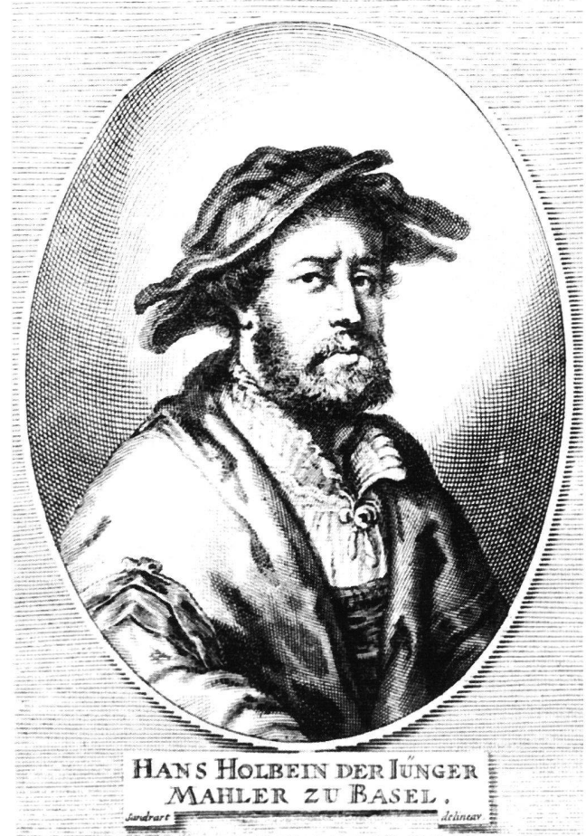
Fig. 3 Hans Holbein the Younger. Illustration from Joachim Von Sandrart, "L'Accademia Todeasca della Architettura, Scultura et Pittura, oder Teutsche Academie der Edlen Bau-, Bild- und Mahlerey-Künste", 2 vols., Nuremberg and Frankfurt 1675–1679, I,2 p. 249.

market, the Grand Duke wrote to Arundel, and begged him to part with a jewel from his own stock, "because I have become passionately set upon having a work by this artist". 22 Arundel duly behaved as a perfect courtier, surrendering the only Holbein portrait which he could not