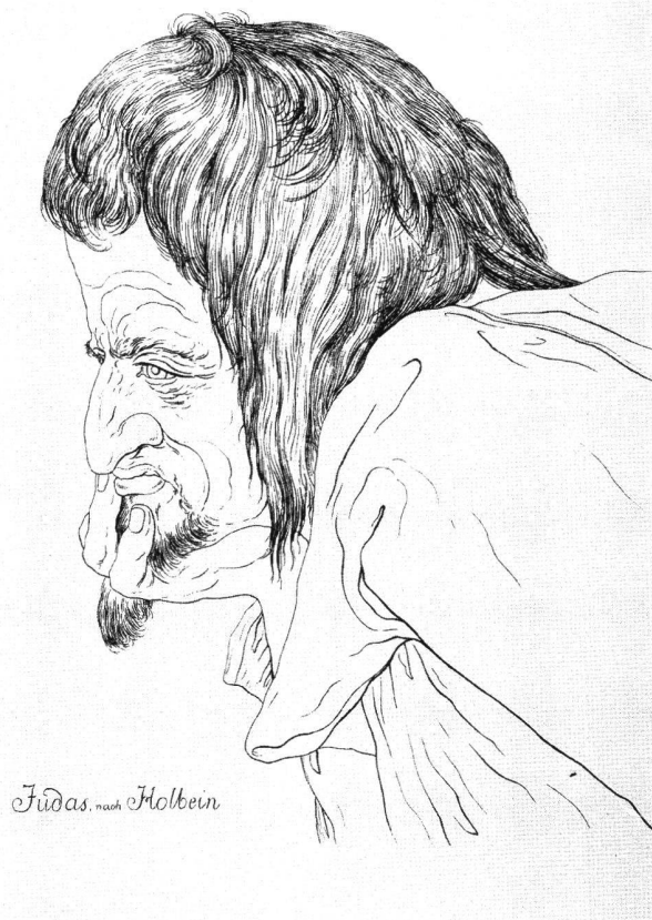
Fig. 4 Judas, as painted by Holbein in the Basle Last Supper. Illustration from Johann Kaspar Lavater, "Physiognomische Fragmente, zur Beförderung der Menschenkenntnis und Menschenliebe", Leipzig/Winterthur 1775–1778, 4 vols.

works. To him, contrary to Mariette and Dezallier d'Argenville, they were gothic . His own country house, near Twickenham, marked the birth of the Gothic revival. It had been designed for a man who thought that the Greek style was not the quintessence of architecture, and that private lodgings required a more fanciful style: "one only wants passion to feel gothic". 40 And Strawberry Hill had a Holbein room. 41 Its decoration was neo-gothic; the light was filtered by antique stained-glass windows and the Holbein portraits, copied after the famous drawings in the royal collections, were framed in black and gold borders. The chimney piece was "chiefly taken from the tomb of Archbishop