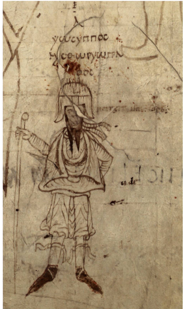
Figure 2. Bern, Burgerbibliothek, Cod. 50, folio 2r, detail. 'Josephus, the Writer of History'