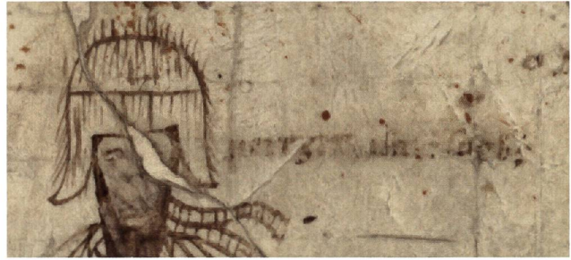
Figure 7. Bern, Burgerbibliothek, Cod. 50, folio 2r, inscription to the right of 'Josephus, the Writer of History'

A second inscription just to the right of the Bern portrait of Josephus is now barely decipherable by autopsy (fig. 7). It is possible to offer a conjectural reading of the legible letters. It likely begins pereg (?) or pergit (?) (from pergo , to rush or hasten) and ends sophus (?) with some half-dozen letters in the middle unrecognizable. It is difficult to make sense of the inscription, and in any event there is no trusting the accuracy of a scribe who misspells on the folio ιστοριόγραφος and who writes Ave Maris ( sic ) in place, obviously, of Ave Maria! 43