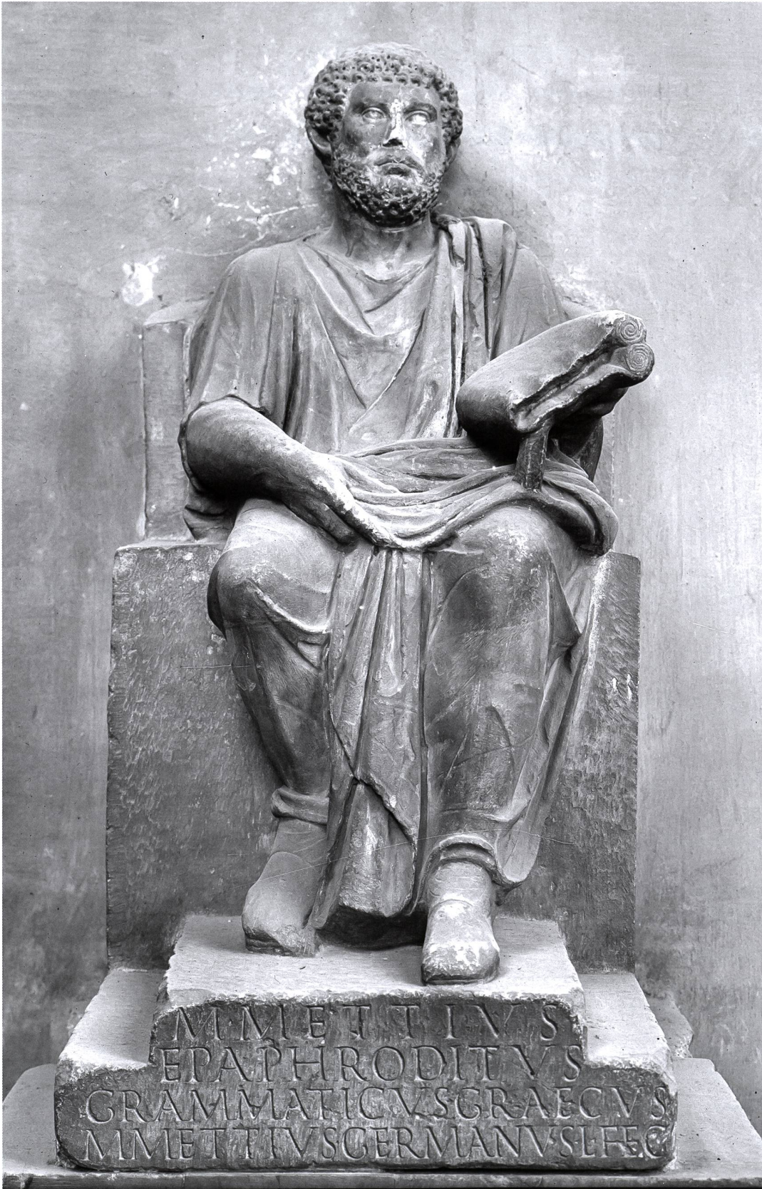
Figure 4. Seated Statue of M(arcus) Mettius Epaphroditus Grammaticus Graecus, M(arcus) Mettius Germanus I(ibertus) fec(it). Palazzo Altieri, via del Gesù 49, Rome. Approximately half life-size: height with plinth 92.5 cm, height of seated statue 82 cm