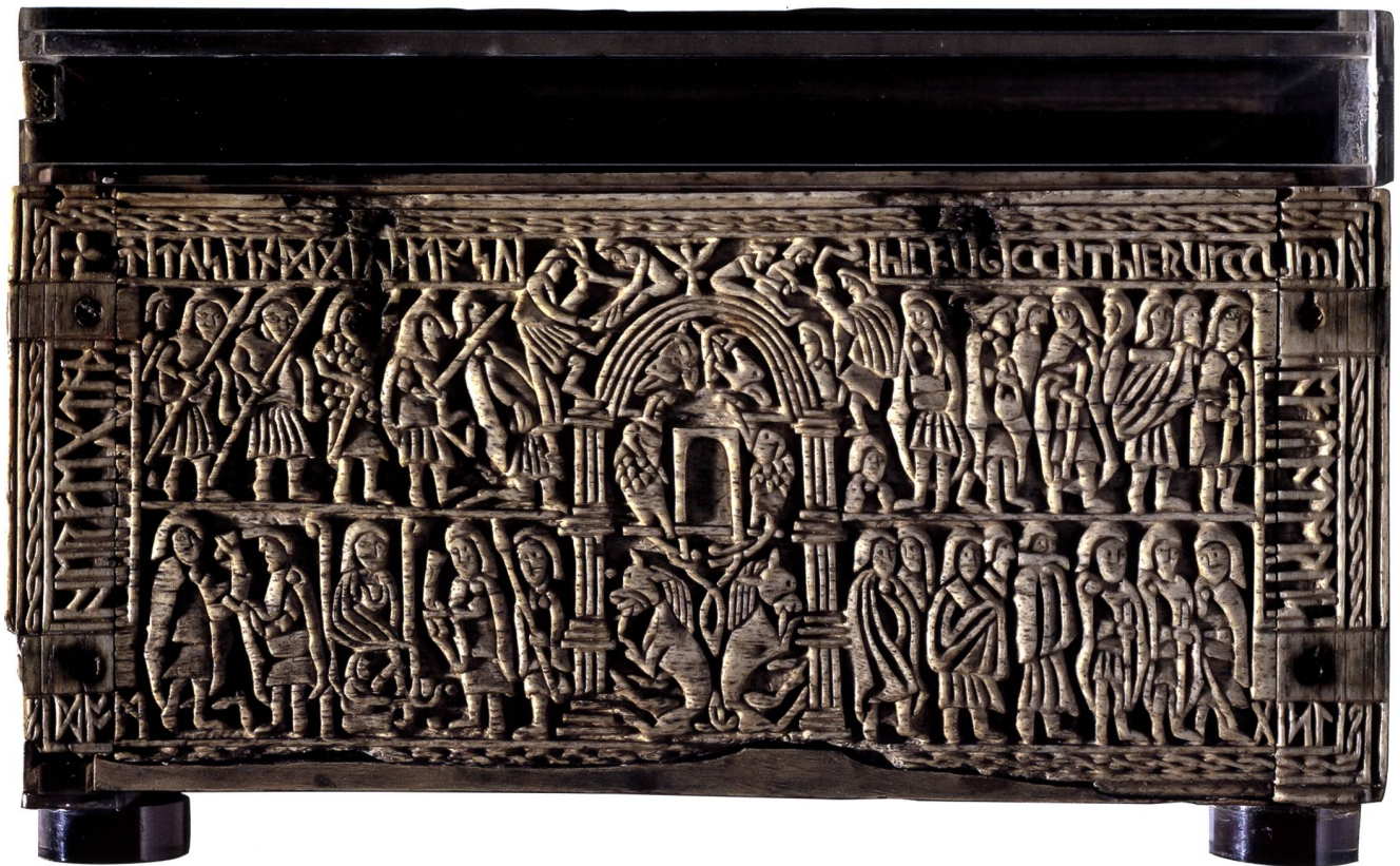
Figure 5. London, British Museum, Franks (Auzon) Casket, rear, showing the story of the siege of Jerusalem by the Roman general Titus: (centre) the Temple; (upper register) (left) soldiers led by Titus and (right) the flight of the Jews; (lower register) (left) 'judgement' and (right) 'hostage'. Dimensions: length 22.9 cm, width 19 cm, and height 10.9 cm

upper and side registers along the right-hand side of the panel, according to the Latin legend, 'Here its inhabitants flee from Jerusalem' ( Hic fugiant Hierusalim afitatores [habitatores] ); and in the corresponding lower right-hand corner is the designation 'hostage' (Anglo-Saxon: gisl ). 39