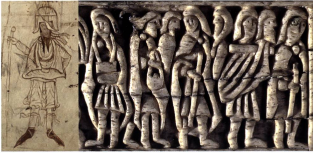
Figure 6. Comparison: Bern, Burgerbibliothek, Cod. 50, folio 2r, detail. 'Josephus, the Writer of History' and London, British Museum, Franks (Auzon) Casket, rear, showing (upper right) the flight of the Jews.

artworks suggest a common derivation. Homberger saw a connection between the rendering of the drawings in the Bern manuscript and carved reliefs of the Carolingian Metz School. 41 The heavily inked lines of the manuscript drawing have an incised quality, and the image itself shares the three-dimensionality of the figures on the whalebone panel. In so many ways the pen-and-ink rendering of the Bern Josephus seems comparable to the relief carving on the Franks (Auzon) Casket.