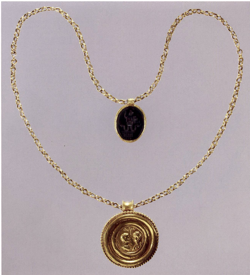
Fig. 1 Necklace with gold marriage medallion (ca. 400–500) and hematite amulet (ca. 100–200). From Rome. Metropolitan Museum of Art, Rogers Fund, 1958, inv. no. 58.12

fied with a divine power called Abraxas. However, the inscription that accompanies the image mentions Harpocrates, the son of the Egyptian goddess Isis. The chain and the two contrasting medallions were likely buried during the Goths' attack of Rome in 410 (or the Vandals' in 455) and supposedly belonged to a Christian who combined faith in Jesus with belief in the amulet's protective powers. 3 Such objects invite a critical review of our binary categories of 'pagan' and 'Christian'. The modern division of Romans into 'pagan' or 'Christian' presupposes clear-cut boundaries that tend to oversimplify the complexity and dynamic character of individual and group identities in Late Antiquity. Thus, they prevent us from seeing the nuances of living in the Roman and post-Roman world.