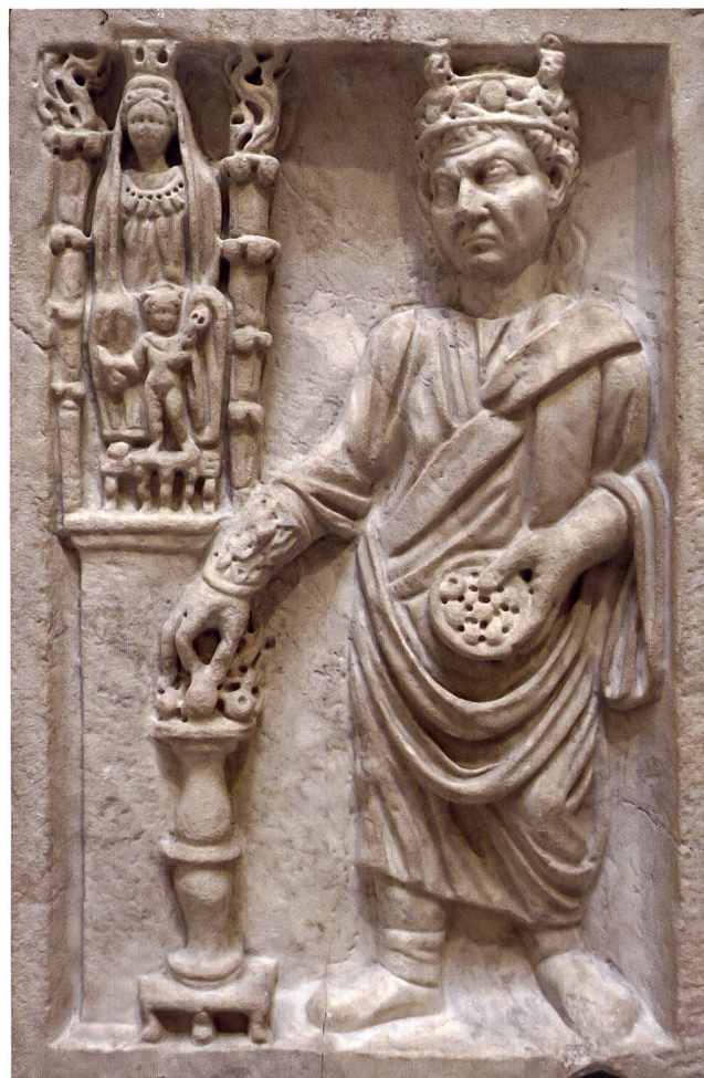
Fig. 3 Funerary relief of high priest ( archigallus ) of Cybele shown sacrificing to the goddess. Marble, 0,62 × 0,60 m, third century CE. From the Isola Sacra necropolis, Ostia.

gious identity, thus shifting the perspective from a unidirectional 'Christianisation' of the Alpine regions to the multidimensional notion of 'Christianness'. This adjustment of our lenses also covers systematic attempts at proselytising, which loom particularly large in narratives of Christianisation, but it equally highlights the range of religious identities that prevailed in the area. Secondly, this volume draws attention to the cultural coherence of the area from Turin to Trent and from Milan to the Alpine passes. In the past, scholars tended to study the spread of Christianity by modern province – i.e., in Lombardy, Piedmont, Ticino – which significantly hampered the ability to recognise recurring patterns that span the Alpine region. 15 A more comprehensive view can provide clues to understanding these complex social and cultural processes. The volume at hand takes a first step in this direction, providing the foundation for further exploration, particularly with regard to the region north of the Alpine passes, whose study along the same lines is crucial to an integrative approach.