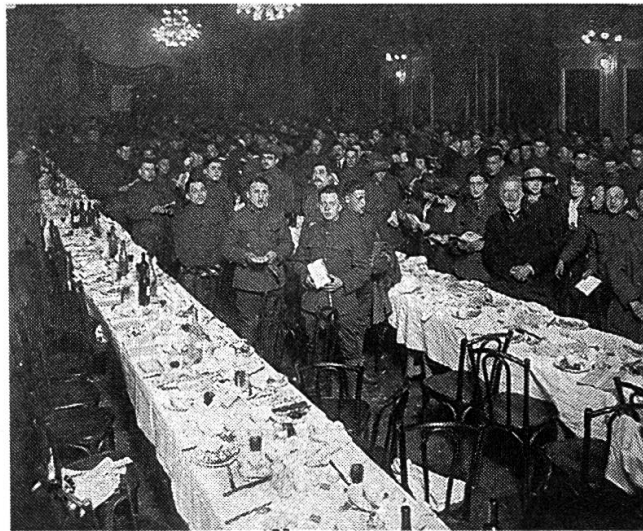
Picture 1: Passover Seder, April 1919, provided for American Jewish soldiers in France by the Jewish Welfare Board. Attendees are standing to sing «The Star Spangled Banner».